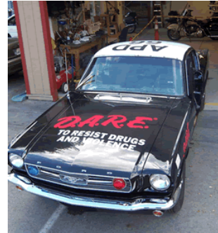
Vintage APD D.A.R.E. Mustang

The Atherton Police Department first offered the D.A.R.E. curriculum to Atherton elementary schools in the fall of 1996.